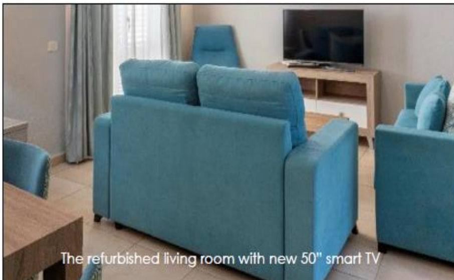
The refurbished living room with new 50" smart TV

The maintenance team keep the swimming pool clean and look after repairs and maintenance to keep your villas in tip-top condition.