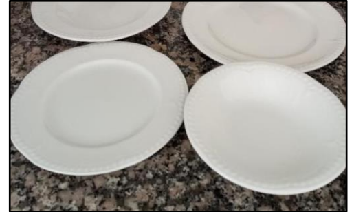
New "Churchill" crockery was purchased for 21 Villas This remains part of an ongoing renewal program.