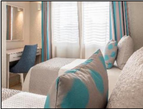
This year, the bedrooms in 17 two-bedroom villas were fully refurbished, including the renewal of bedside tables, dressing tables with mirrors, chairs, lamps, curtains, and soft furnishings,