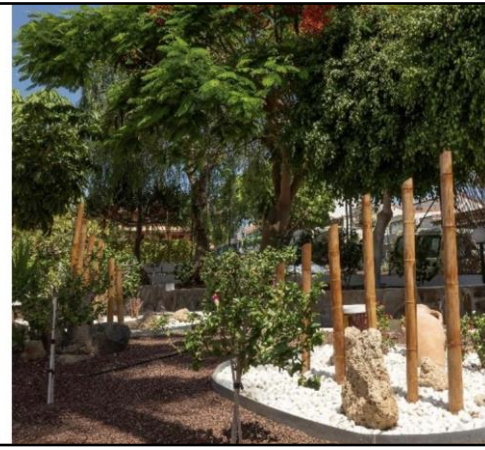
Our external gardening company, Tudors, takes care of the gardens four days a week. The gardens are currently looking spectacular.