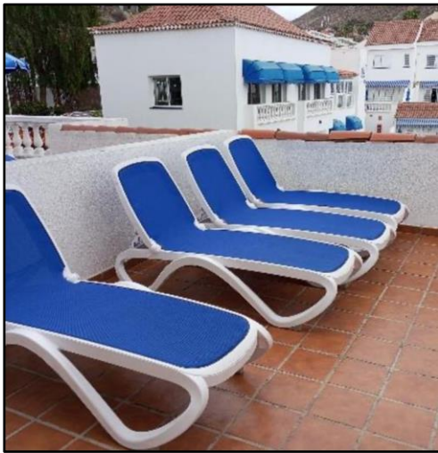
New sun beds were placed in Villas 31, 33, 38, 40, 42, 48, 52 and 71, and new terrace tables and chairs were installed in Villas 61 to 69 and 71.